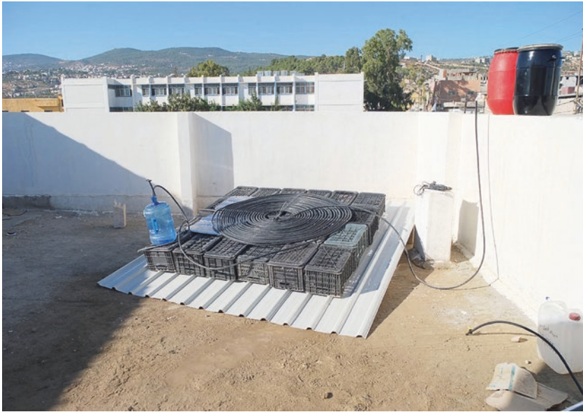
Fig. 1 A simple system for heating water and insulating the zinc roofs developed specifically for and with refugees in Jerash camp

approach within the refugee context can be indeed beneficial and powerful, but only when it responds to urgent issues and demands coming from within the refugee community itself, and when the approach is not imposed on them by external institutions or actors. At times, these impositions can come from architectural schools, or from architects who want to “prove” that their ideas can serve the community.