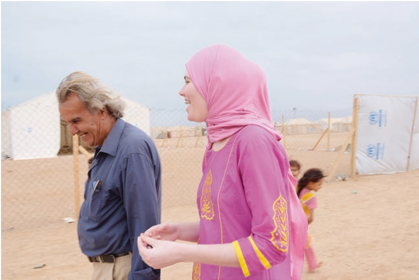
Fig. 5 A Yemeni refugee from Aden and an NYUAD student from Bosnia connect through shared languages. Obock, Djibouti.

Some students were able to see themselves in the refugees, much as some refugees were able to see themselves in the students. For students with migration backgrounds, the connections were even more immediate and profound. Zara, a Somali woman from Finland, was confronted with her own experience as a child of refugees: