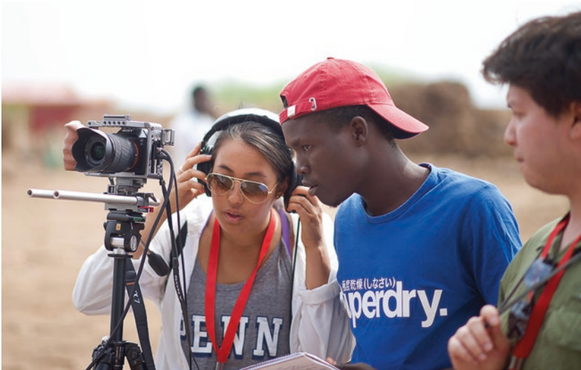
Fig. 4 Members of the UPenn and Kakuma document the food distribution system