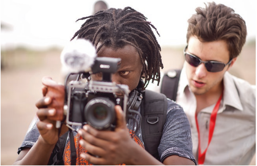
Fig. 1 Members of the UPenn and Kakuma team documenting the healthcare system capture B-roll