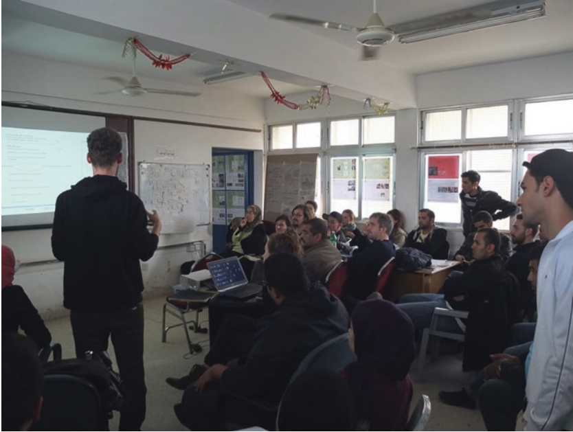
Fig. 2 Workshop between the students and the refugee community in Jerash camp

In contrast to a design-oriented approach that tends to overlook refugees' needs and demands, I suggest that a research-oriented and politically informed practice is much more powerful when working in a refugee context, as shown by an example from a research-based studio conducted in Berlin (Fig. 2).