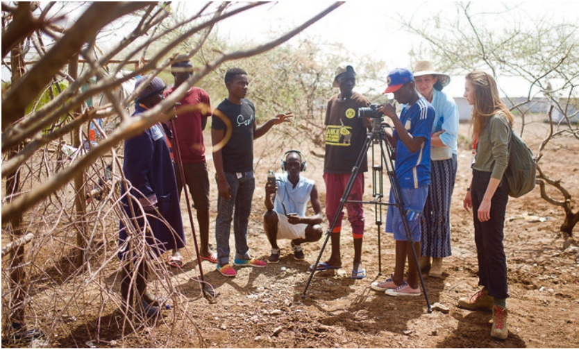
Fig. 3 Members of the UPenn and Kakuma team conduct an interview with a resident