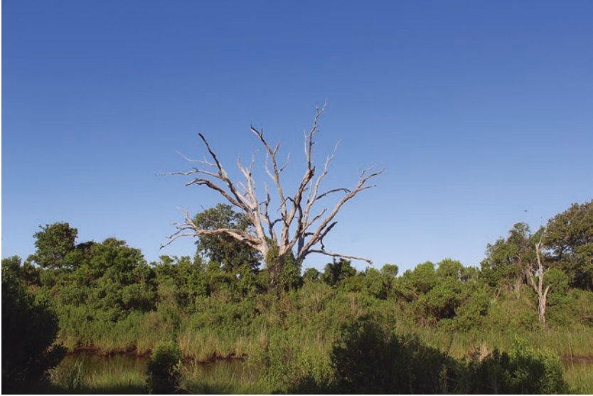
Figs. 1, 2, 3 (continued)

Unity3D and tested with middle school students in eighth-grade classrooms in Lafayette, Louisiana. That pilot came about because educators believed that Louisiana's students and citizens, who are on the front lines of land loss, need a deeper understanding of their coastal environment. The VREC pilot supported a scientific and technology-centered perspective of ecological issues, and its place-based education model connected students to the environment in which they live.