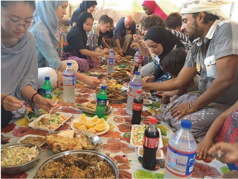
Fig. 3 Hospitality in the camp. Obock, Djibouti.