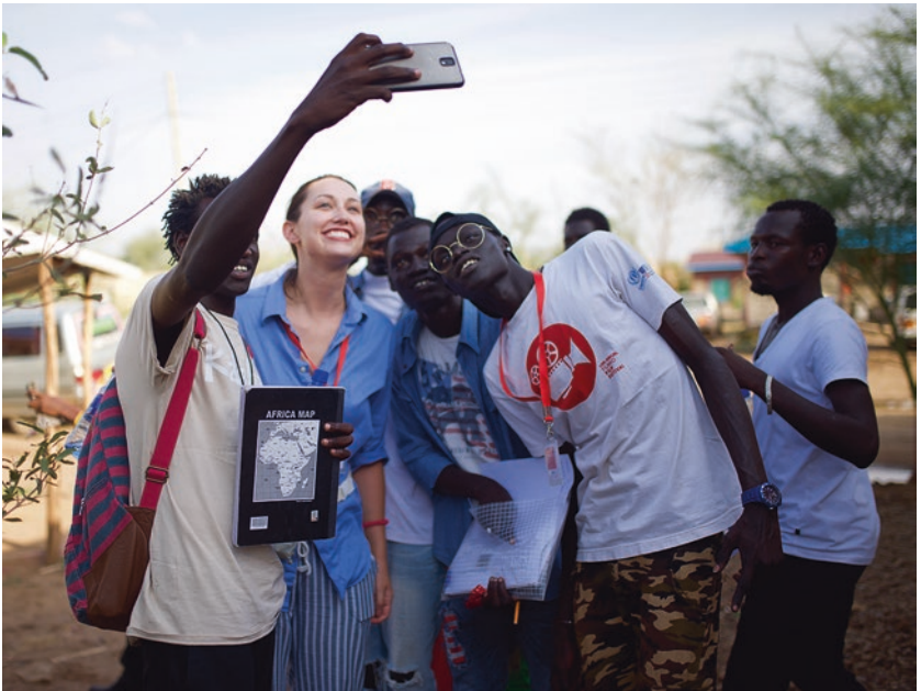
Fig. 2 Part of the UPenn and Kakuma team documenting the water system takes a selfie