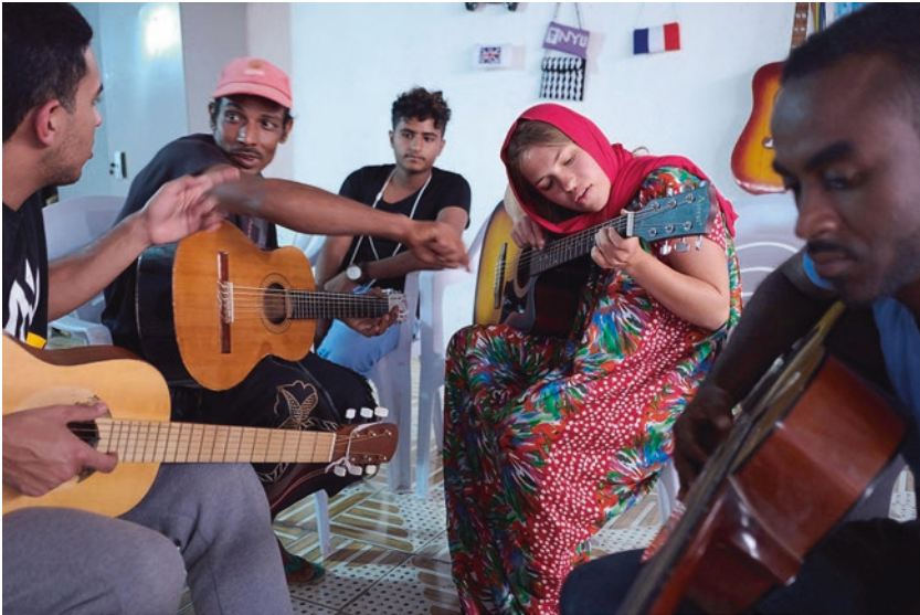
Fig. 4 An NYUAD student from New Zealand being taught Arabic guitar scales. Obock, Djibouti.

Many students noted how this course had altered their preconceived notions of refugees and their views on migration: “I think what has stayed with me the most is how complicated everything relating to refugees and forced migration is”; “what has stuck with me is not only the unfairness [of their situation], but just how easy it is for all of us to ignore suffering;” “I became especially sensitized to the narratives of a ‘deserving’ refugee, when people would justify why letting somebody in is okay while others is not, using meritocratic reasoning;” “I had studied migration a lot in high school but my understanding was dry and theoretical. Now I see migration as a basic right;” “I am now for open borders and global free movement of peoples.” Arguably—and as this very essay collection demonstrates—many of these “lessons” could be learned by other means,