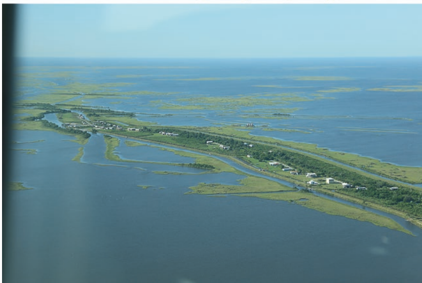
Figs. 1, 2, 3 The impact of rising sea levels on Isle de Jean Charles