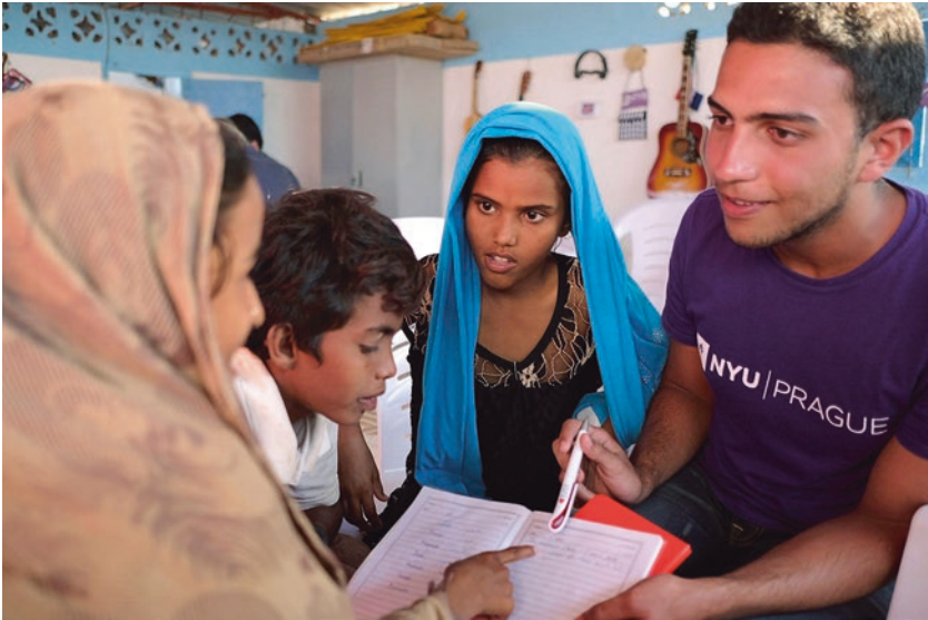
Fig. 2 An NYUAD student from Egypt teaches English to young students. Obock, Djibouti.

henna party for the women, a beach day for the men, an outing to a nearby riverbed, and a dance party the night before our departure.