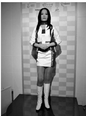
Figure 2: The “gynoid” robot ACTROID-DER, developed by KOKORO Inc. for customer service, appeared in the 2005 Expo Aichi, Japan. The robot responds to commands in Japanese, Chinese, Korean, and English. 4

So the special humanoid shape has to be added to the general definition of “robot.” The complexity which is requested in the definition of robots (see above) generally exists within humanoid robot systems, the descriptions in the humanoid robots catalogue on the web site of the SFB 588 “Humanoid Robots – Learning and Cooperating Multimodal Robots” may confirm this (SFB 588).