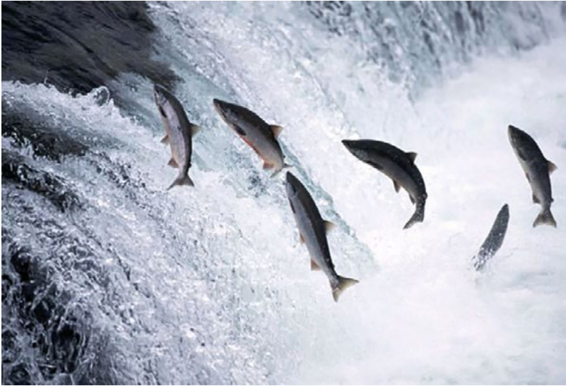
Figure 6. Ushashamek or Atlantic salmon moving up the river of their birth to breed.

(CAM), which brought all the Innu and Attikamekw communities together and was responsible for undertaking negotiations with Canada and Québec in respect of the Innu self-determination and ancestral domain.