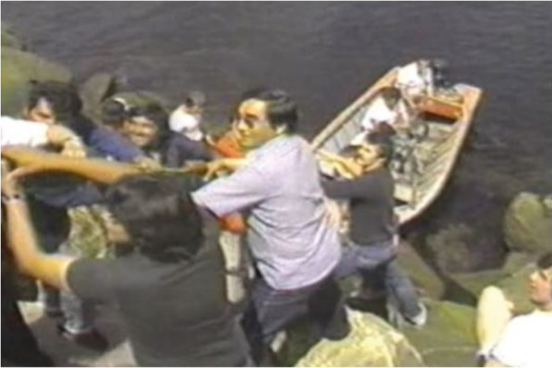
Figure 11. Indigenous leaders pulling Essipit's 'symbolic net'.

dock in order to exercise maximum pressure on the Québec government. 93 The first blockade, with the tension it generated, is reported as the beginning of the 'true' war. 94