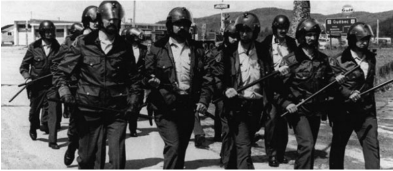
Figure 9. Québec Police force intervening in Listuguj, June 1981 (Obomsawin, Alanis, Incident at Restigouche, National Film Board, 1984)

fisheries, that occurred between indigenous groups and the Québec state, but also involving Euroquébécois villagers. It reached intense peaks during the summer fishing seasons of 1980 and 1981. The feuds left a heavy scar on the small community of Essipit and those involved refer to the episode as the ‘most significant moment of their lives’. Perceived as a cathartic time for the group, the conflict is apparently now identified by its members as the main source of the community’s subsequent revival and increased self-reliance. As with other Innu communities who live by a salmon river, the war looms large in Essipiunnuat political memory. This current research, however, focuses entirely on the Essipit community.