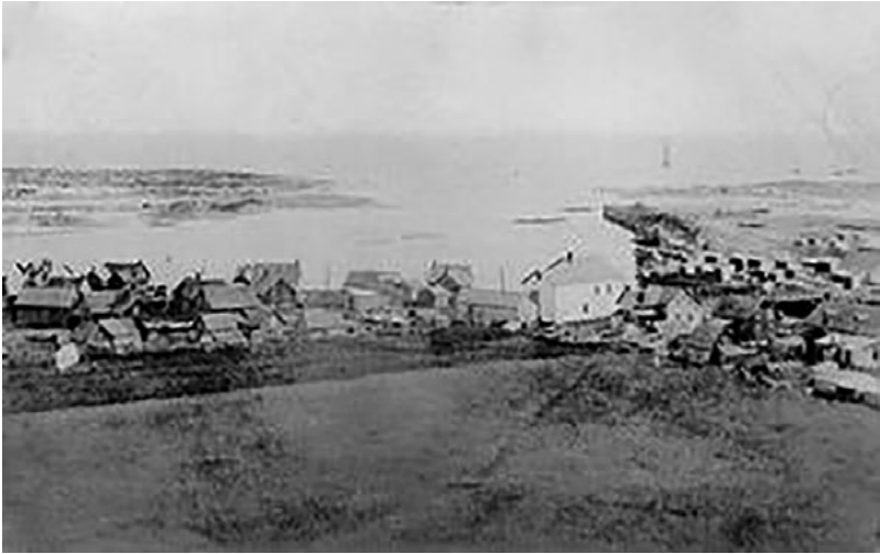
Figure 4. Les Escoumins township c.1912 (from family archives).

the referential in which the concept takes root is far from the European conceptualisation of land and power (Savard, 1981; Gendreau and Lefèvre, 2016). In fact, abstract words such as ‘property’ or the legal concept of ‘fee simple’, do not exist as such in Innu-aimun (Mailhot and Vincent, 1979). Tipenitamun carries the meaning of responsibility, management or control over something, and kanauentamun means guardianship over something (Ross-Tremblay, Motard et Vincent, 2015). Tipenitamun refers to an intergenerational approach to relating to Assi , and must be understood outside a bureaucratic conception of land title (CAM, 1993). Because of the indivisibility between being ‘Innu’ and ‘Assi’, identifying with the idea of consenting to the extinguishment of Innu tipenitamun would ultimately mean self-annihilation. Tipenitamun is used to refer to