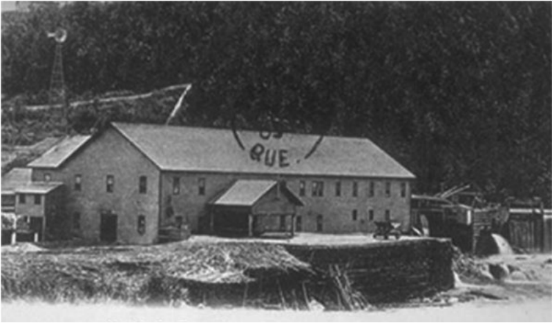
Figure 7. Sawmill and dam built on the Esh Shipu river (from a postcard, family archives).