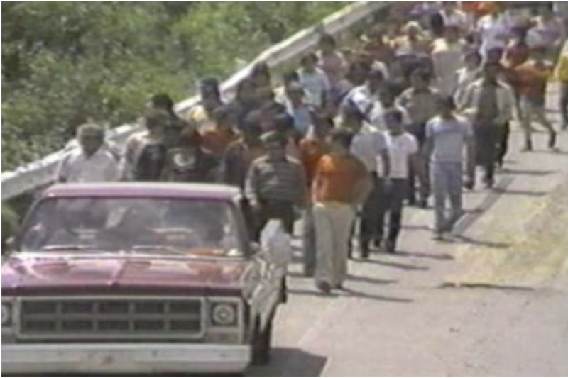
Figure 10. March of First Peoples in support of Essipiunnuat during the Salmon War. CBC/Radio-Canada Archives, 1981.

at least two interacting sides, strategy is thus characterised by its adaptability in the deployment of means.