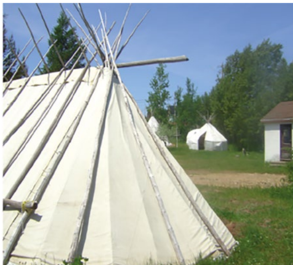
Figure 14. A present-day traditional site (personal archives, 2010).

It is seen as imperative for children and young people to overcome the colonial representations of Innu society as deficient and degenerate, condemning people identified with it to failure, dependence and despair. The new generations should be aware that being Innu is 'something very positive in our lives' and 'a treasure of knowledge and wisdom that you hold' (Napeo, chapter 4, ref. 4). Not adopting this attitude is to dishonour your own heritage; not recognising and honouring the deeds of preceding generations and our