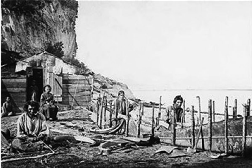
Figure 3. Innu family on the edge of the St Lawrence River, near a village today called La Malbaie, dated 1863.

It is worth mentioning, however, the excellent novel Kitchike , by the Wendat novelist Louis-Karl Picard-Soui, who exposes with intelligence and perspicacity the power relations within the First Peoples communities situated in the south of the province of Québec. His novel exposes with humour but great realism