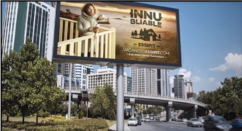
Figure 2. 2016–17 marketing campaign, taken from https://www.grenier.qc.ca/nouvelles/7949/vacances-essipit-devoile-as-nouvelle-identite-visuelle (accessed 20 May 2015).