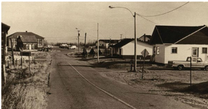
Figure 12. Essipit 1980s, Institut culturel et éducatif montagnais (ICEM), 16440.

had suffered negative if not racist propaganda and stigmatisation as well as the manoeuvres of the minister Laurent Lessard. He had played a predominant role in calling for the repression of the Innu uprising, and so Lévesque effectively decided from then on to deal with the Innu people himself. This change in the Québec discourse would have resonated deeply among the Essipiunnuat.