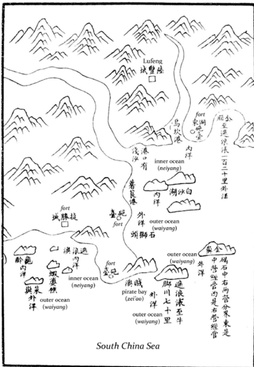
Map 2. Inner and Outer Oceans on the Lufeng Coast, Guangdong Province, c. 1820 Source: Guangdong tongzhi . [Gazetteer of Guangdong province], comp by Ruan Yuan. (Canton, 1822).

to set limits on the reach and responsibilities of the state and to regulate government operations across the sea space.” As the Qianlong and Jiaqing emperors repeatedly mentioned, officials in coastal areas dared not to