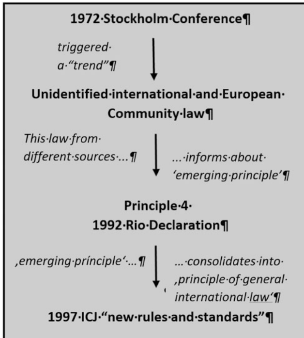
Fig. 3.1 Identification of principles of general environmental law by the Iron Rhine Award

35 In order to verify the existence of an international legal duty to prevent significant environmental harm within the territory where the development project is situated (Fig. 3.1), the Arbitral Tribunal in the 2005 Iron Rhine award first referred to the 1972 Stockholm Conference on the Environment. 72 This event was considered as the starting point of a ‘trend’ in international and European law to integrate environmental measures in the design of economic development activities. Instead of identifying the relevant pieces of legislation, the Tribunal decided to point at Principle 4 of the 1992 Rio Declaration, which the tribunal viewed as capturing the said legislative trend. Principle 4 emphasises that “environmental protection shall constitute an integral part of the development process and cannot be considered in isolation from it.” Labelled as an ‘emerging principle’ in the year 1992, the Tribunal considered it to be a ‘principle of general international law’ in 2005 with reference to