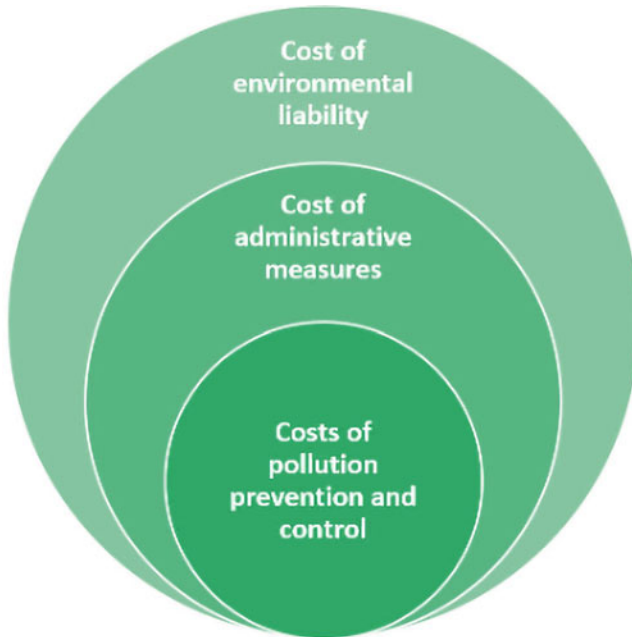
Fig. 3.2 Expansion of the polluter-pays principle

Despite the omnipresent invocation of the polluter-pays principle in international, regional and national instruments, the principle’s legal implications are far from clear. 82 The arbitral tribunal in the 2004 Rhine Chlorides case supports this view by observing that “(the polluter-pays) principle features in several international instruments, bilateral as well as multilateral, and that it operates at various levels of effectiveness. Without denying its importance in treaty law, the Tribunal does not view this principle as being a part of general international law.” 83 On this basis, the tribunal refused to consider the principle under Article 31(3)(c) VCLT, which allows for the systemic interpretation of a treaty by taking into account “any relevant rules of international rules of international law applicable between the parties”. Although,